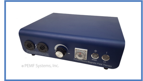
RC Max PEMF 120 Tabletop

Designed for use in Athletes' Homes, Team-Training Facilities, Sports-Medicine Departments, and Professional Practices.