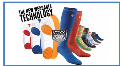
Voxxlife Human Performance Technology (HPT)

Corrects musculoskeletal imbalance – most notably functional short leg and forward head posture and is part of our back, joint and overall spinal protocol.