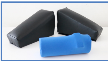
Pelvic Correction Kit

Butterfly, Paddle, Large Loop, 30 Foot Rope Coil, and Pad. RC&T's proprietary personal best performance and personal best fitness protocols use the coils above.