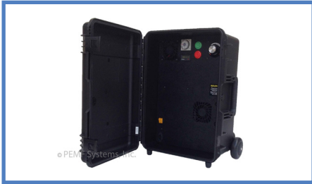
RC Max PEMF 120 Portable

Portable or Tabletop, 5 Coils, Pelvic Correction Kit, Human Performance Technology, US$20,200